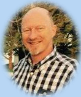
Steve Allison, Minister

“WHICH SIDE OF THE ROAD WOULD YOU LIKE ME TO DRIVE ON TODAY?”