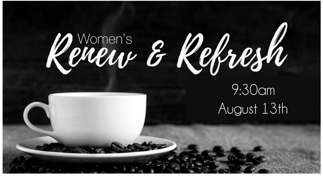
Listen to my voice in the morning, Lord. Each morning I bring my requests to you and wait expectantly. Psalm 5:3

Have you seen the show that has taken the world by storm? The Chosen is the first ever multi-season series about the life of Christ. We will be watching the 8 episodes of Season 1 this summer. Grab your coffee, bring a friend, and settle in for a great show and great discussion each week.