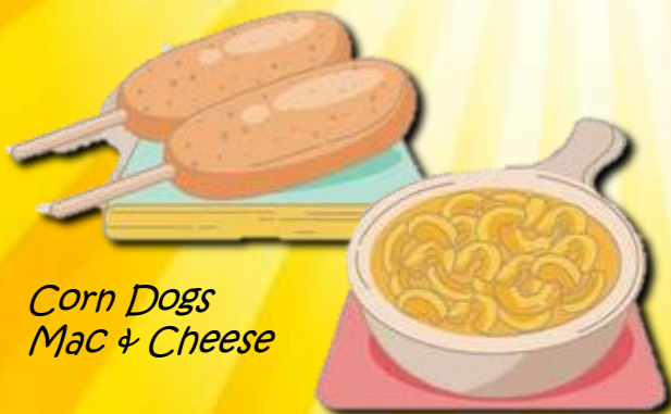
Corn Dogs Mac + Cheese